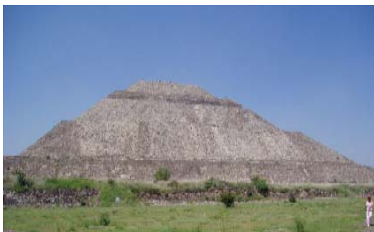
The Pyramids of Teotihuacan in Mexico June 1, 2006 - June 29, 2006