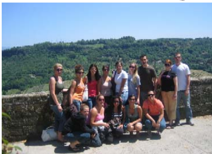
Students in Florence, Italy May 24 - June 25, 2006

The students had a wonderful learning experience and several can’t wait to go again next summer.