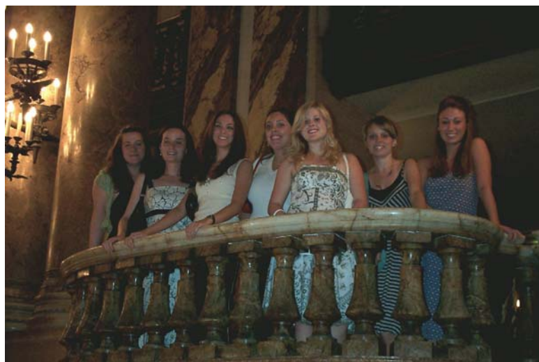
Students in Paris, France at the Opéra Garnier July 1, 2006 - July 29, 2006