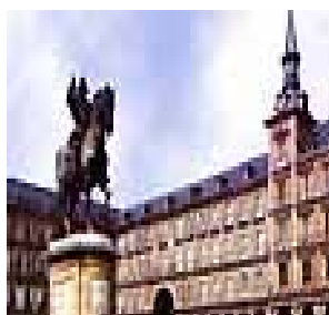
Plaza Mayor Madrid, Spain built by Philip III between 1617 and 1619