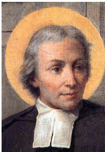
Painting of Saint John Baptist de la Salle

JUL 3/THU—ARRIVE PARIS DEGAULLE AIRPORT/REIMS. Meet English speaking escort and transfer by private coach to Reims, Visit the Cathedral, birth site of de La Salle and a local champagne cave for champagne tasting (de La Salle comes from the Moët Champagne family on maternal side.) Dinner and overnight at Hotel Best Western de la Paix. www.bestwestern.com (D)