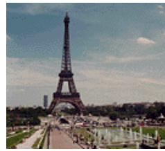
The Eiffel Tower...

Valid U.S. Passport is required for travel, valid at least 3 months beyond return date.