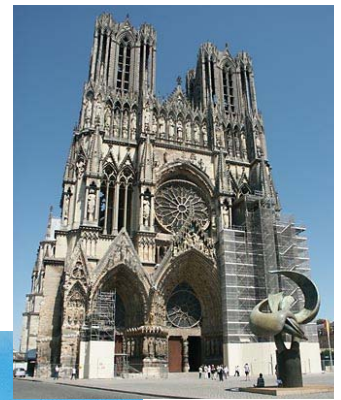
The Cathedral At Reims...